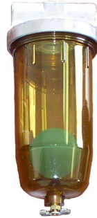
Item #8 Plastic Moisture Trap PN: LWTR02