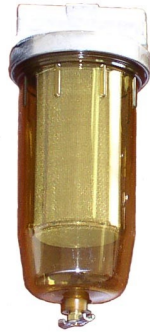
Item #6 Plastic Pre-Filter PN: LWTRPF02