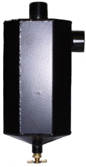
Item #2 Oil Catch Muffler PN: MFOCPV