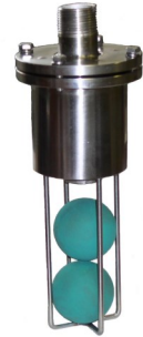
Item #10 Primary Shut-Off Steel PN:LWTRPV3

Item #5, Vac/Press Gauge, PN:GAGE016, Item #7, Vacuum Relieve valve included with pump Item # 11, Pressure Relief Valve, PN:RVP10P